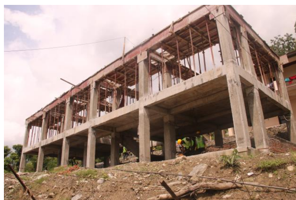
Second level under construction, July 2019