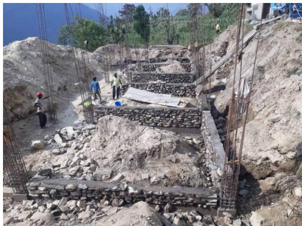
Foundation of boys' quarter finished construction ongoing, May 2019