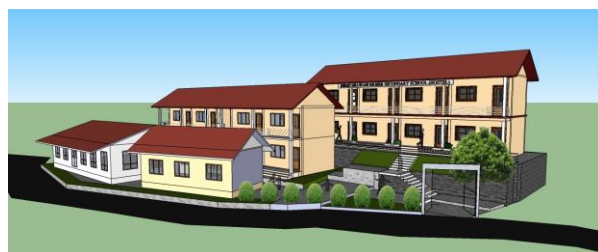
3D design of the final "Himali Chhatrabas"