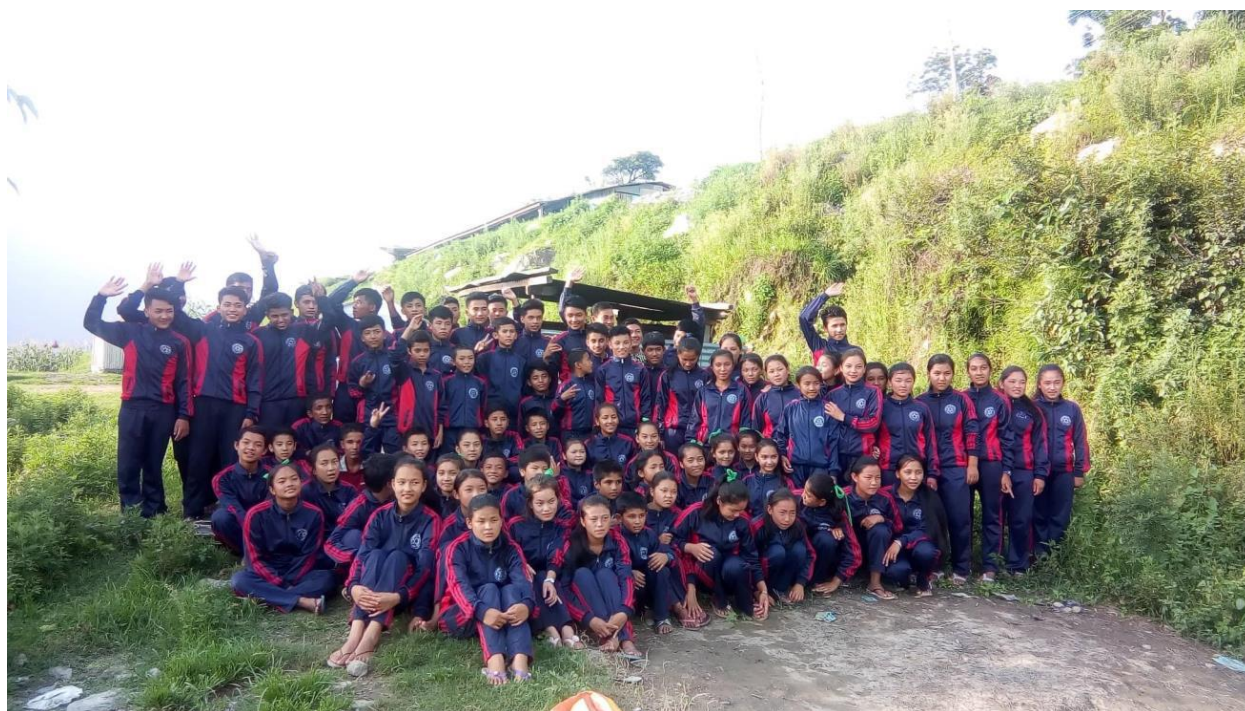
Students of the School Boarding House „Himali Chhatrabas“ (after completion of Phase I and II in May 2018)