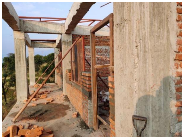
Wooden windows and door frames being installed, December 2019