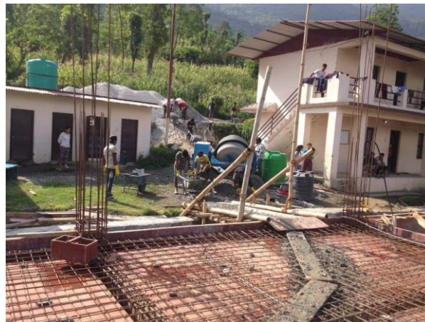
Proceeding smoothly, first level completed, July 2019