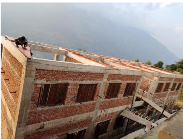
A mason working on the construction site, December 2019