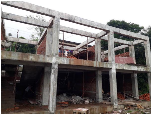
Ongoing construction works, during monsoon summer 2019