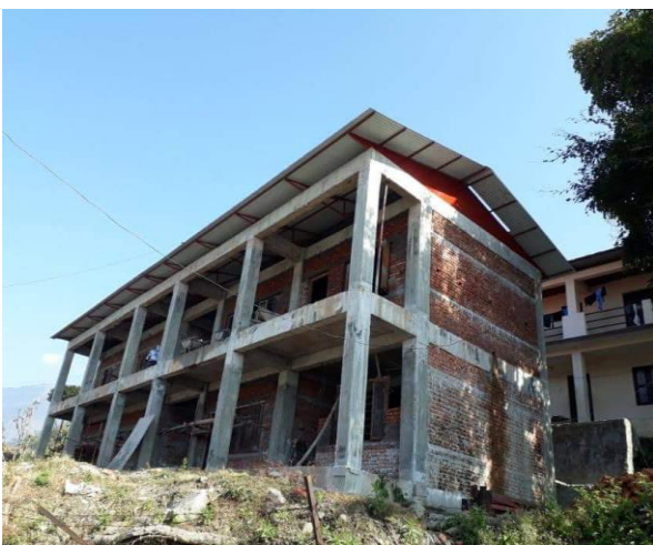
The appearance of the hostel after installation of the roof, January 2020